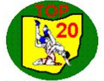
OhioWrestler.com TOP 20 LIST

Wrestling Begins: 9:00 am - D1, D2, D3 (Age as of 11/28/08: D1: 6 & under; D2:7-8; D3:9-10) ~12:30 pm - D4, D5 (D4:11-12; D5:13-14 High School Wrestlers are not eligible)